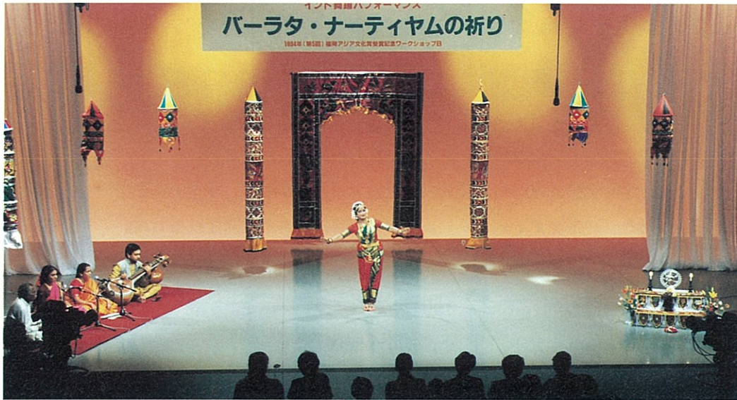
ワークショップ会場 Dance Performance Hall