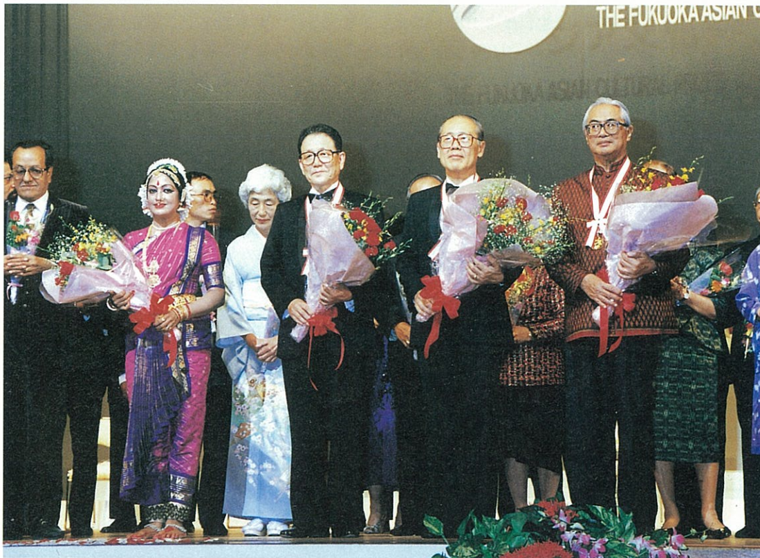
授賞式のフィナーレ アジア各国大使御夫妻もステージに上がられ、受賞者を称えられた。 The Prize Presentation Ceremony Finale. On the stage, the Ambassadors of Asian Countries and their spouses praised the recipients.