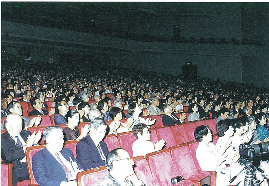
会場を埋めた参加者 The ceremonial hall was filled to capacity.