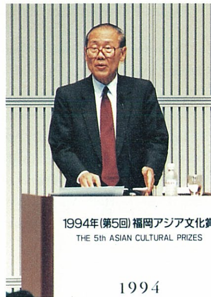
講演する王賡武氏 Professor Wang Gungwu elaborated on his life experiences