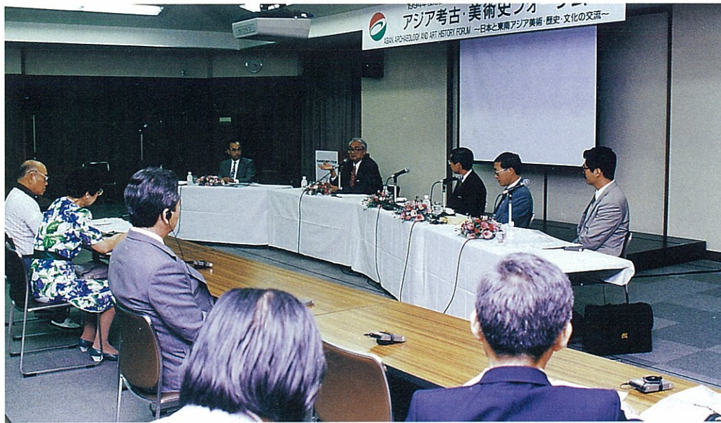
ワークショップ会場 Workshop C was held at International Hall, Kyushu University