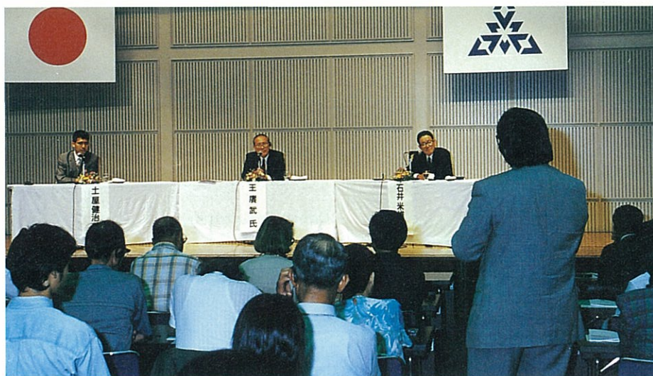
活発な意見交換を行う参加者 Participants exchanged inspiring views.