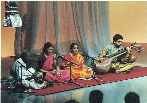
ヴィーナー、ムリダンガの演奏 Musical performance of Veena and mridanga