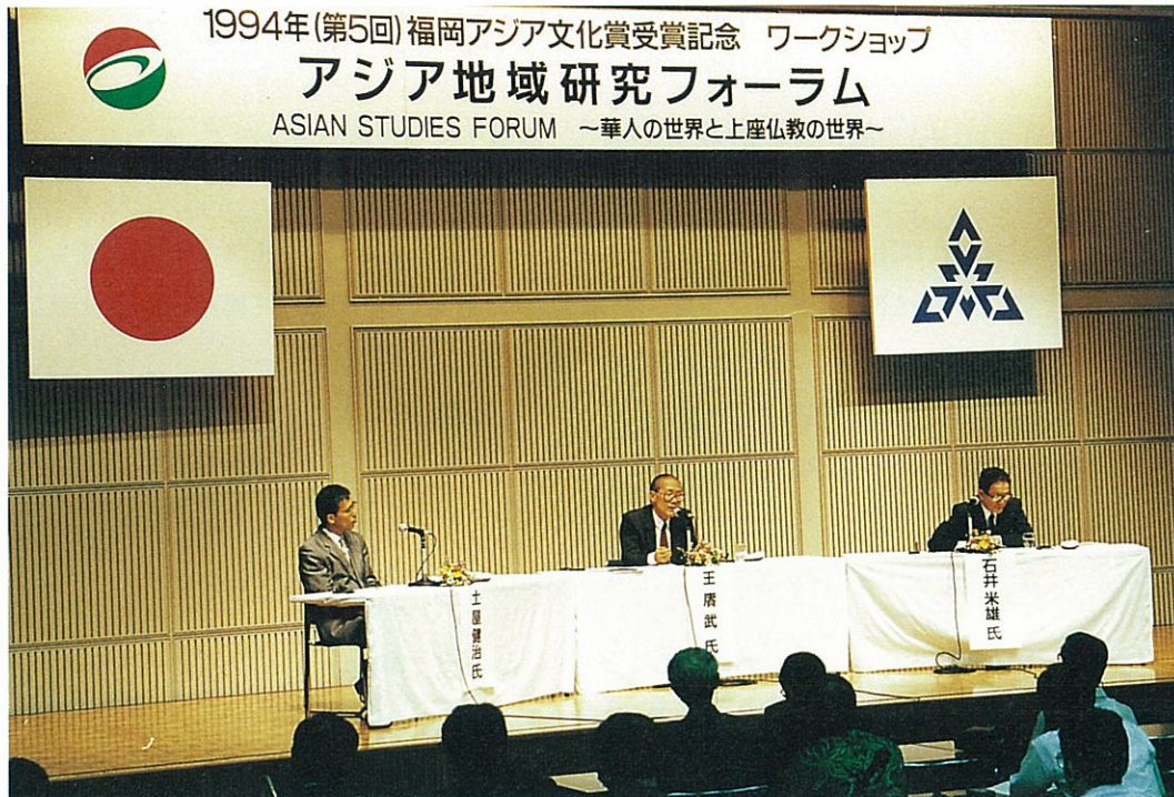
ワークショップ会場 Workshop A at Auditorium, Fukuoka City Hall