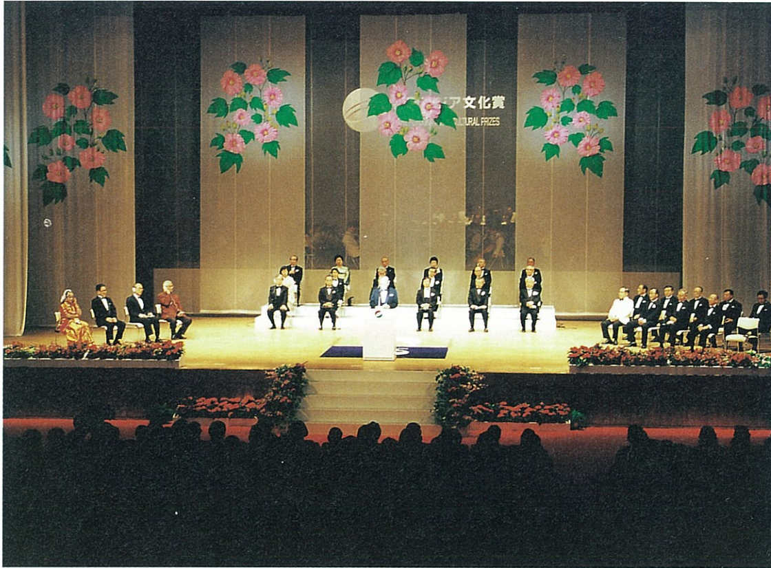
1994年（第5回）福岡アジア文化賞授賞式 The 5th Fukuoka Asian Cultural Prizes 1994 Presentation Ceremony