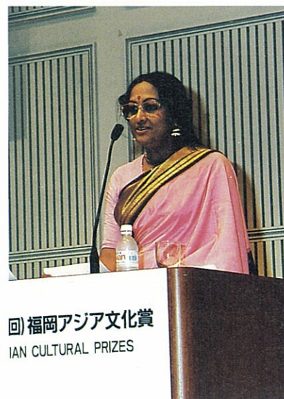
講演するパドマー・スブラマニヤム氏 Dr. Padma Subrahmanyam presented her Commemorative lecture.